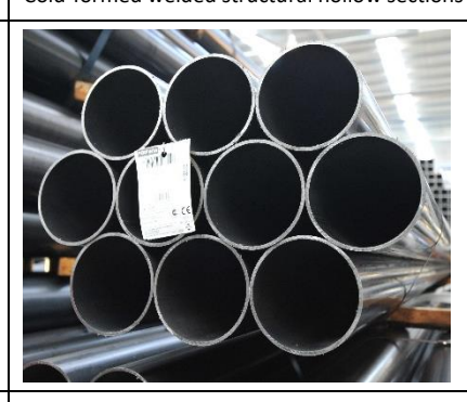
Illustration of the product:

Cold-formed welded structural hollow sections of non-alloy and fine steel grains steels